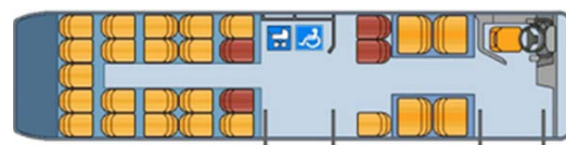
28 seats + 1 wheelchair & pushchair area