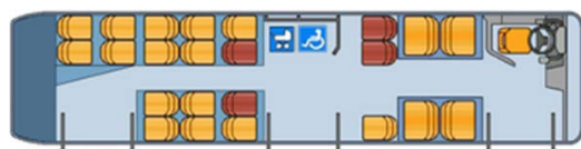
23 seats + 1 wheelchair & pushchair area